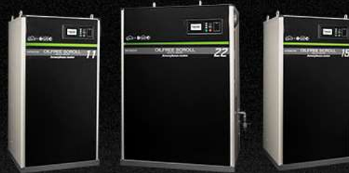
AMORPHOUS MOTOR SRL