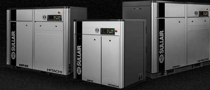
OIL FREE SCREW